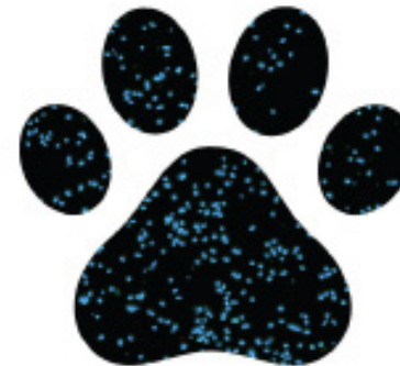
Unprotected Surface After 24 Hours