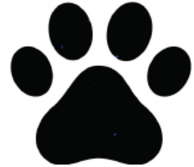
Surface with Microban Protection After 24 Hours

*This information is based upon standard laboratory tests and is provided for comparative purposes to substantiate antimicrobial activity for non-public health applications. Microban technology is not designed to protect users from disease causing microorganisms. Antimicrobial action is limited to product surface and is not intended to protect your pet.